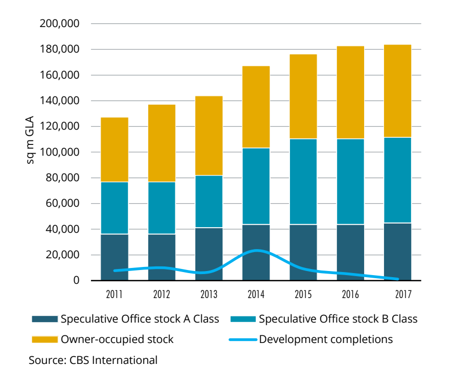
Chart 1 – Skopje office stock